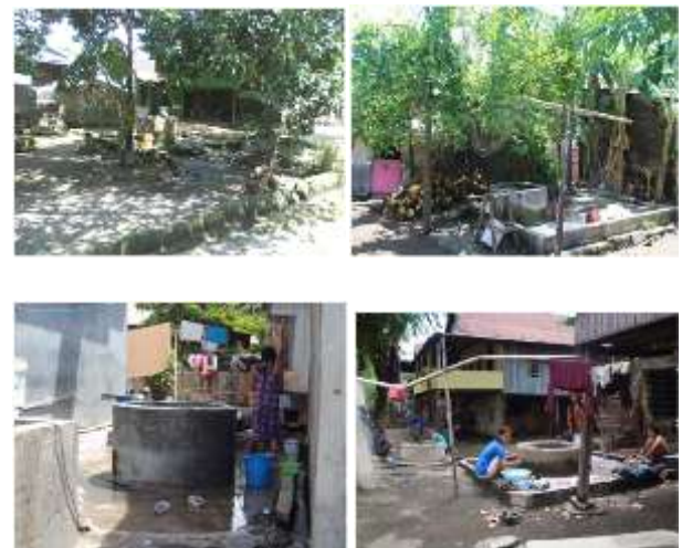
Fig.3: Public wells

At certain hours, public wells are visited by citizens, particularly women. The arrival of women in these places, especially in the morning and afternoon. In the early morning hours, that is between 800 to 1000 hours, when the children had gone to school. The frequency of use is highest in the morning than in the afternoon. Washing clothes is an activity that most frequently used compared to other activity. These activities are carried out jointly, while other needs such as urinating, defecating, and bathing are done individually and sometimes limited by room. At the time of washing that occurs active communication between them, they are often also disputing in the well general. Ablutions are done by men in public wells, before the midday prayer, Asr, and Maghrib. Ablution almost never does in public restrooms or public taps. The following picture shows the situation and conditions in clean water facilities Galesong fishing settlement.