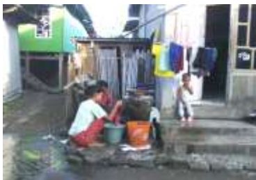
Fig.5: Mutual Assistance between daughter and mother in semi-private wells

Left figure a group of teenagers was taking water at public taps, the distance between teens close to each other. The young women are in a small group of 4 people have an almost same age. The right figure, a condition of public toilets was deserted during the day.