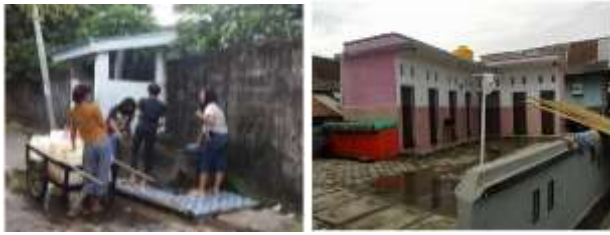
Fig.4: Public taps and public toilets (public toilets)

Left figure a group of teenagers was taking water at public taps, the distance between teens close to each other. The young women are in a small group of 4 people have an almost same age. The right figure, a condition of public toilets was deserted during the day.