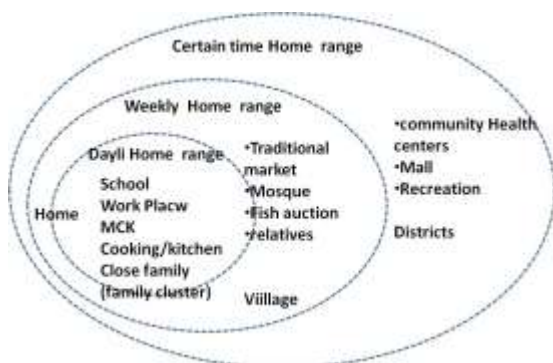
Fig.7: The movement of the population based on fishermen's routines

Separation by age group shows that adult women, the elderly, children and young women are still in the zone nearest the house in activities.